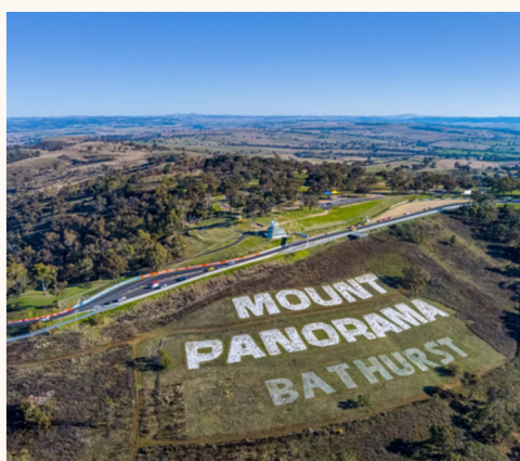
BATHURST 1000 Page 8