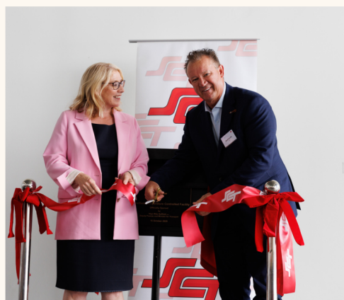
WA FACILITY OPENING Page 5