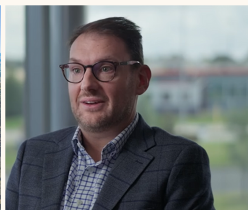
QMETRIX CASE STUDY Page 9