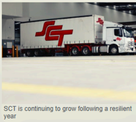
SCT is continuing to grow following a resilient year

The business has grown from moving shipping containers for customers by trucks to where they needed to be to being the first private rail operator in Australia to operate between Melbourne and Perth, linking east and west.