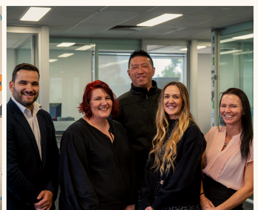
GEM AWARD WINNERS Page 3