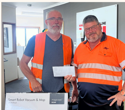
CHRISTMAS HAMPER WINNERS Page 7