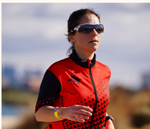
OUR PEOPLE PUSHING LIMITS Page 4