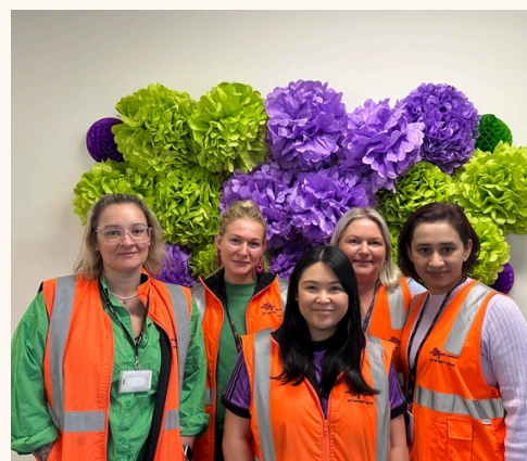
INTERNATIONAL WOMEN'S DAY Page 8-9