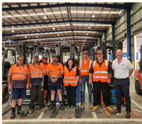
PARKES REOPENING Page 6